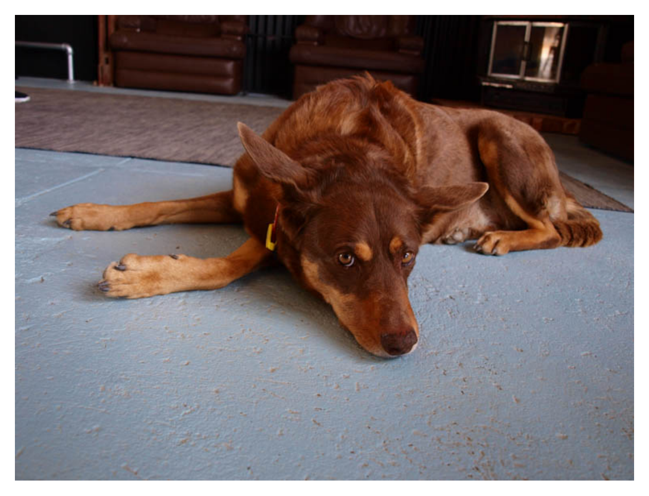
Resident red kelpie Jazz enjoying the ambience